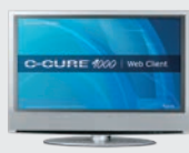
C•CURE 9000 Web Client